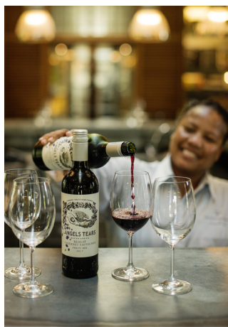
The Tasting Room