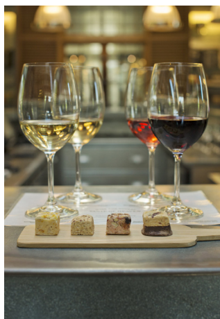
The Tasting Room