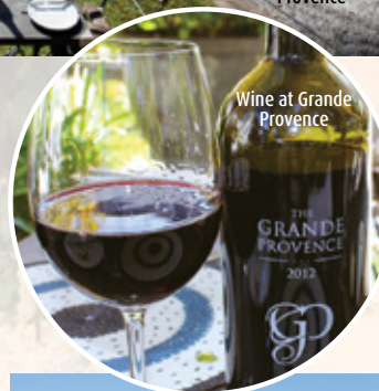
Wine at Grande Provence

CHRISTMAS time is peak summer in Cape Town, and temperatures average between 25°C and 30°C, with 11 hours of sunshine daily. It is also the time when strong south-eastern winds visit. The sun sets early, at about 6.50pm, which is when locals and visitors enjoy their 'sundowner' drinks.