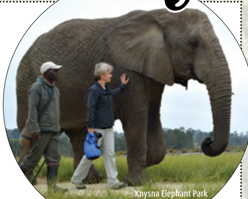
Knysna Elephant Park

Step into The Fish Shop and you'll find a melt-in-your-mouth set you back just €3.