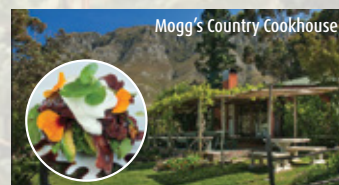
Mogg's Country Cookhouse

Mother-and-daughter team, Jenny and Julia Mogg, serve up the best of wholesome country cooking in a tranquil rural setting in the beautiful Hemel-en-Aarde (Heaven and Earth) Valley just outside Hermanus. It's incredible value, with starters from €2.50 and mains from €5.