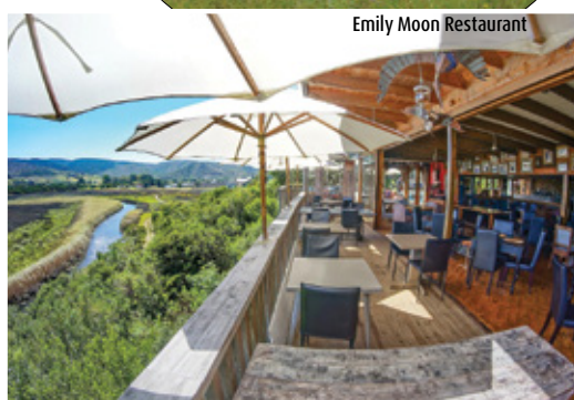
Emily Moon Restaurant