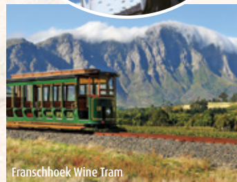
Franschhoek Wine Tram