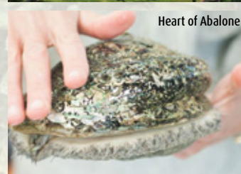
Heart of Abalone